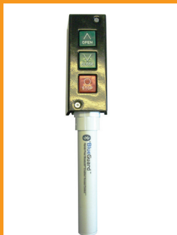
BlueGuard® installed on 3 button station