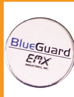
Magnet for programming