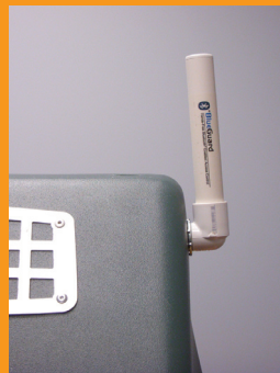
BlueGuard® installed on a gate operator