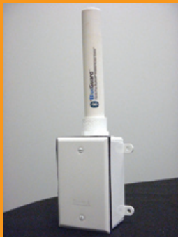
BlueGuard® installed on U-BOX (optional)